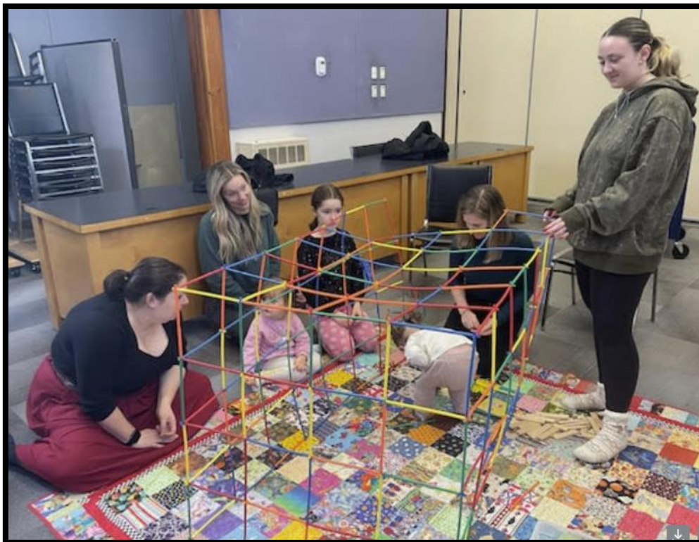
Female engineers in the making...