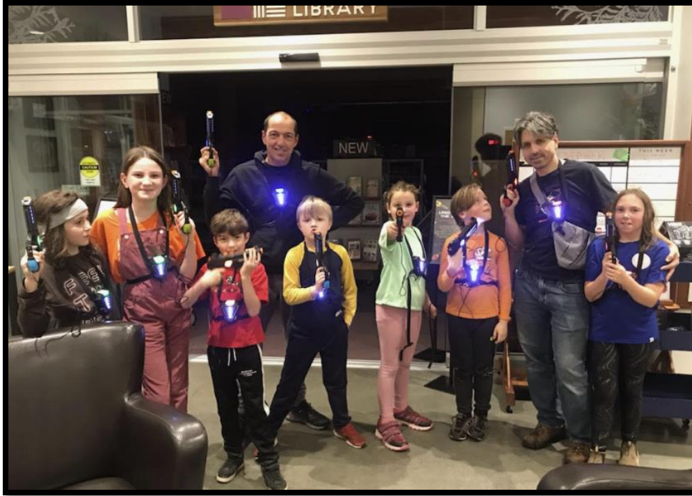
Sechelt Library Laser Tag is back !