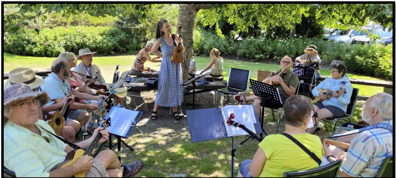
Our first 2024 Ukulele jam – on opening day - was well attended and the music was wonderful to hear!