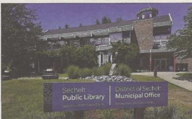
The Sechelt Public Library reopened Thursday, July 11.

After five long months, we are excited to finally announce we will re-open for public access on Thursday July 11 at 10 a.m. On behalf of myself and all our staff, we know that libraries hold such an important place in any community and we are very excited to welcome everyone back!