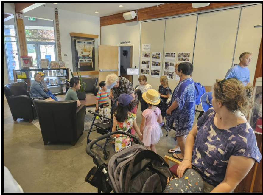
So many people have stopped to read and view pictures from our flood restoration. People also enjoyed our new lobby seating