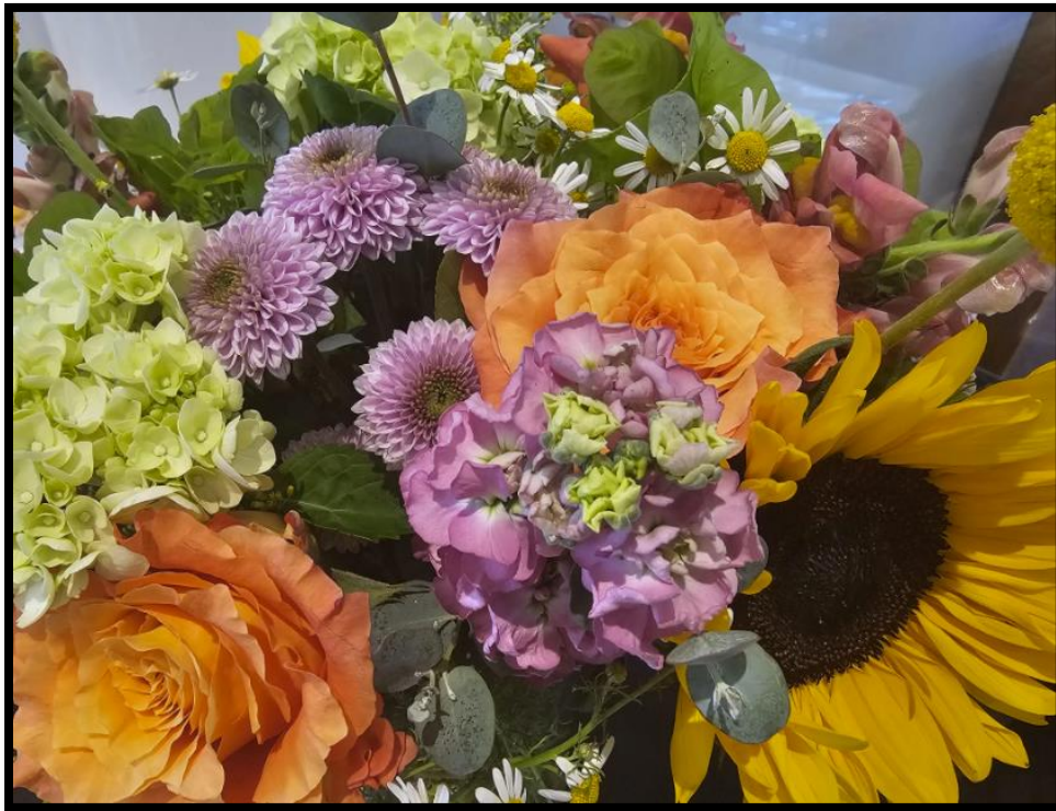
Many flowers were given to us by patrons - and by Gibsons Library Staff