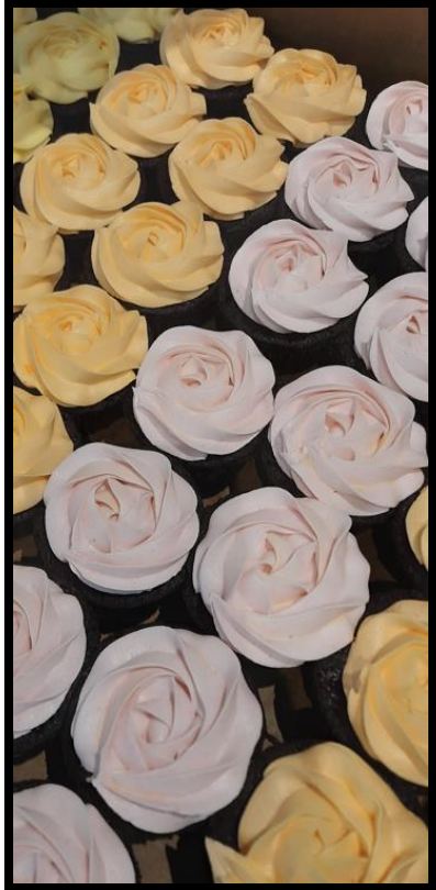
Kids - and all - loved the cupcakes!