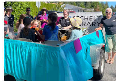
Canada Day Parade 2023