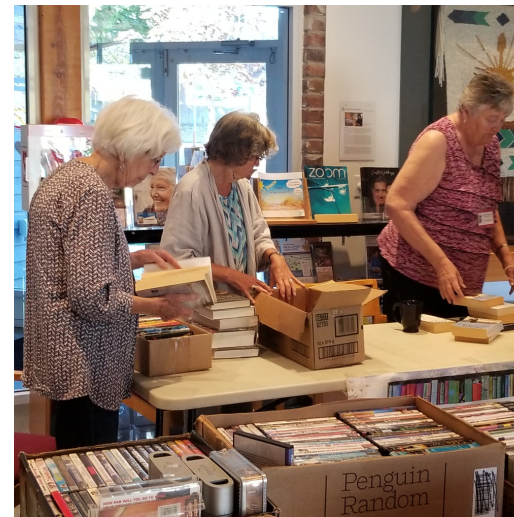
Friends of the Library Book Faire