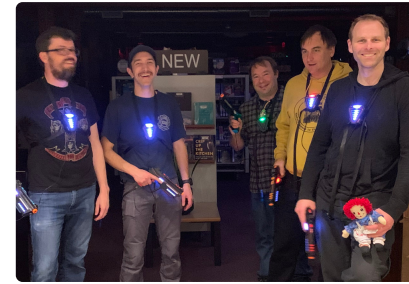
Laser Tag in the Library