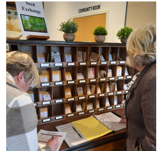
Seed Exchange Library