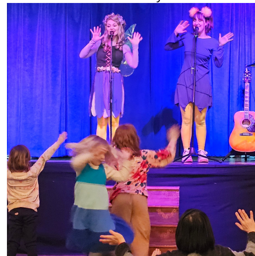
SSC Literacy Coalition Event