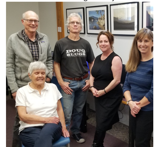
SSC Photography Club Installation