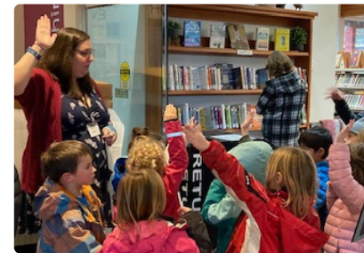
Elementary School Library Tour