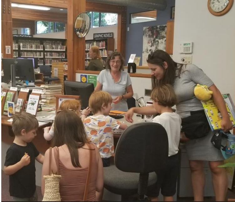
Kids getting their Summer Reading Club weekly stickers