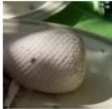
Dinosaur egg cracking!

Teen Scratch and Win is still underway with teens coming in to take out books and get a scratch ticket! We have some great prizes!